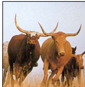
Not A Hard Asset

Most broker dealers now focus on mutual funds and insurance products. Private placements are difficult to get approved. Mutual funds and annuities are easier to sell and the wholesalers have deep pockets to fund B-D conferences for their reps. This is not sour grapes. Just fact. Unfortunately, this leaves the client (remember the client) to fend for themselves when investment issues outside the mutual fund or insurance area become involved. In January I reported that UBS Paine Webber was bringing their Arts and Numismatic Division to the U.S. to work with their private banking clients. Wonder why? The very wealthy, buy things in addition to stocks and bonds and annuities. Things like rare coins, rare stamps, art, antique furniture, antique rugs, jewelry, paperweights, antique firearms...you know, hard assets.